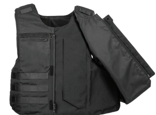
FRONT ZIP, SIDE OPENING DESIGN